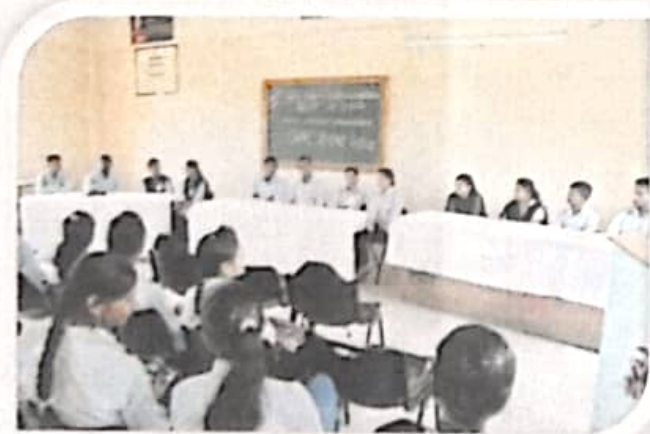
Students participated in quiz competition on voter awareness