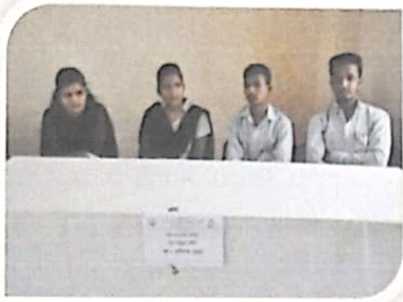
Groups of students participated in quiz competition on voter awareness