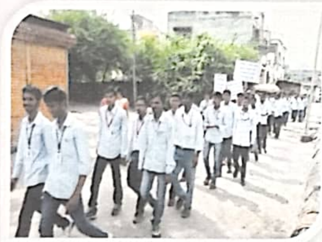
Students participated in Voter awareness rally organize in kolhar village