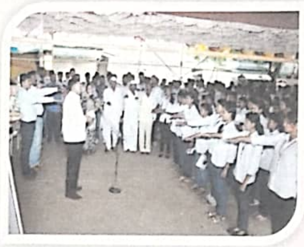
Students took oath for fair voting