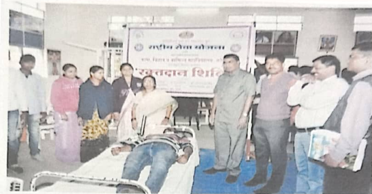
Blood Donors participating in the Blood donation camp