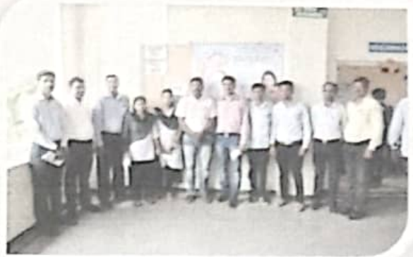
Dignitaries for the inaugural of Voter awareness programme