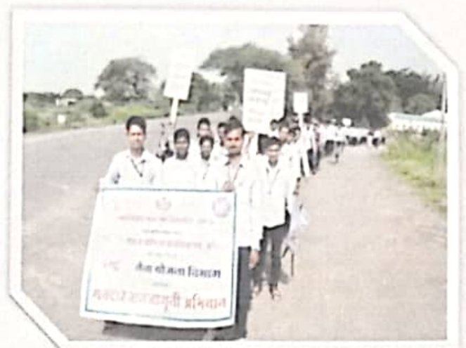
Voter awareness rally organize in kolhar village