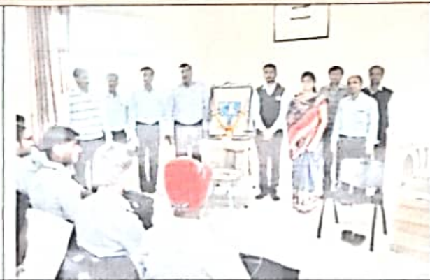
The dignitaries present at the inauguration of the Constitution Day program