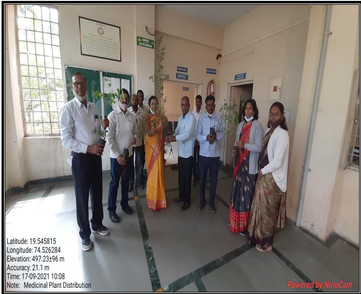
Distribution of Medicinal Plants to the members of Kolhar Gram panchayat on the occasion of Prime Minister Narendra Modi's Birthday