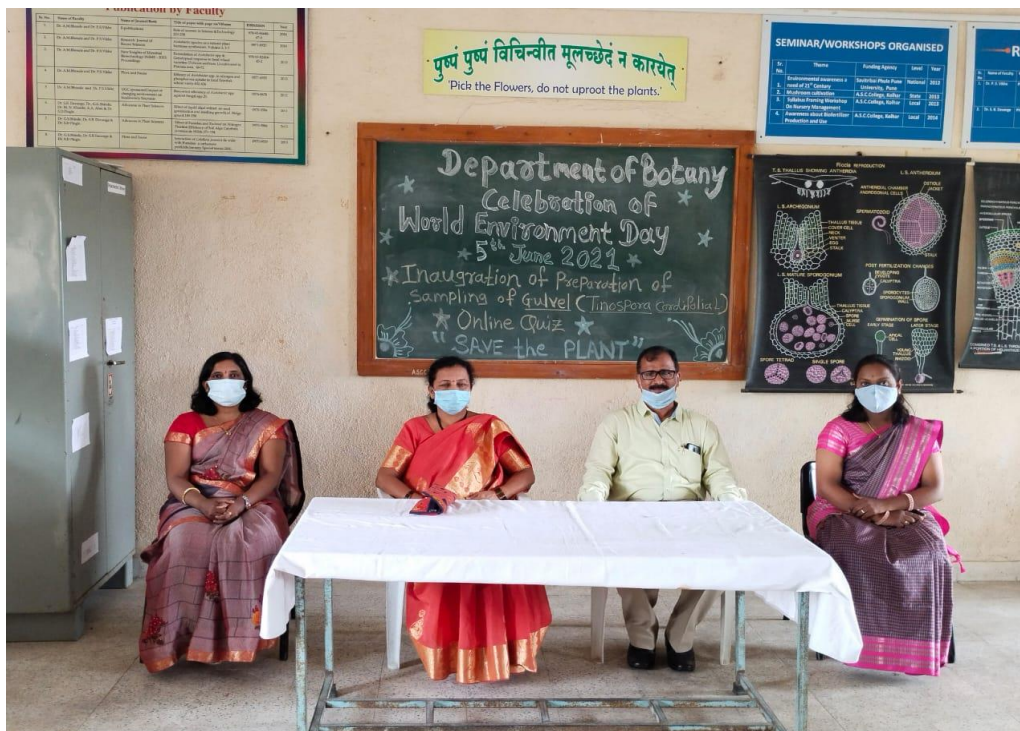
Inauguration of celebration of world environment day