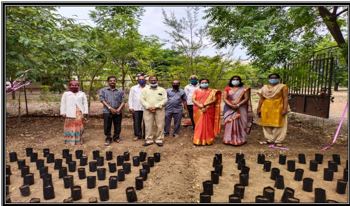
Preparation of Gulvel Sapling