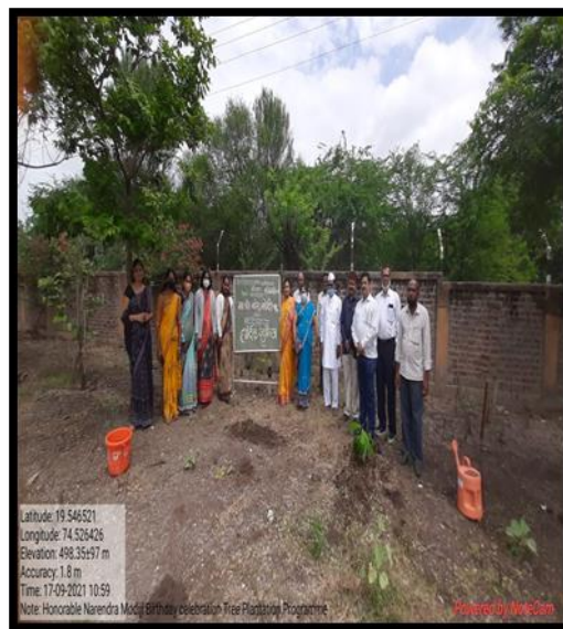
Tree Plantation in College Campus On the occasion of Prime Minister Narendra Modi's Birthday