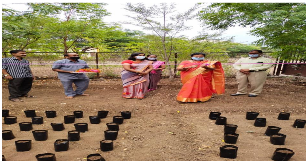
Inauguration of preparation of Gulvel Sapling