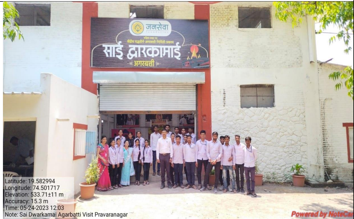
Sai Dwarkamai Agarbatti, Pravaranagar