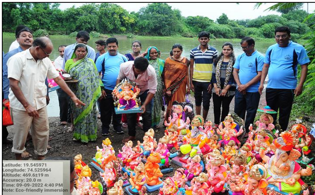
Collection of idols from devotees