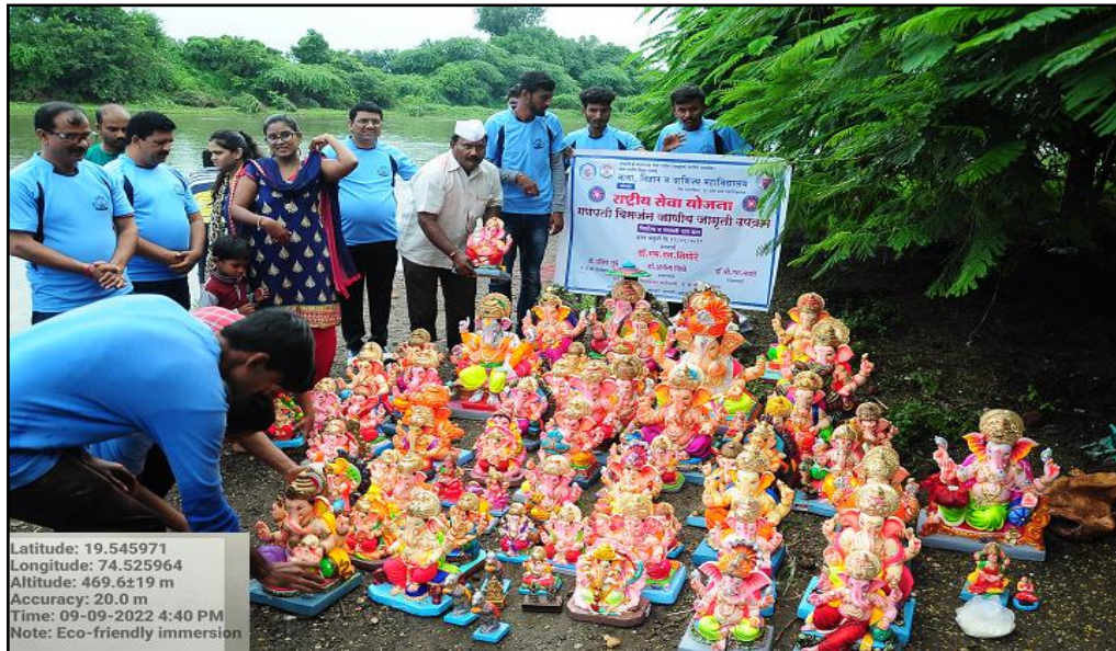
Collection of idols from devotees