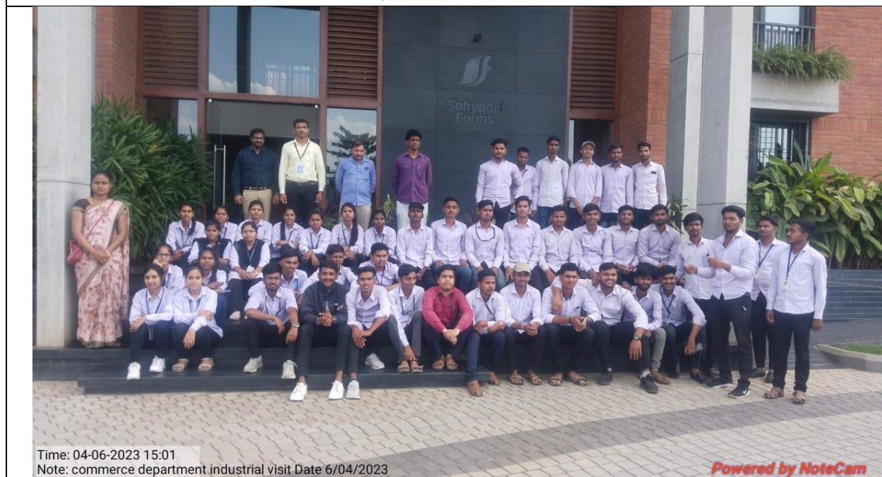
Sahyadri Farms, Nashik