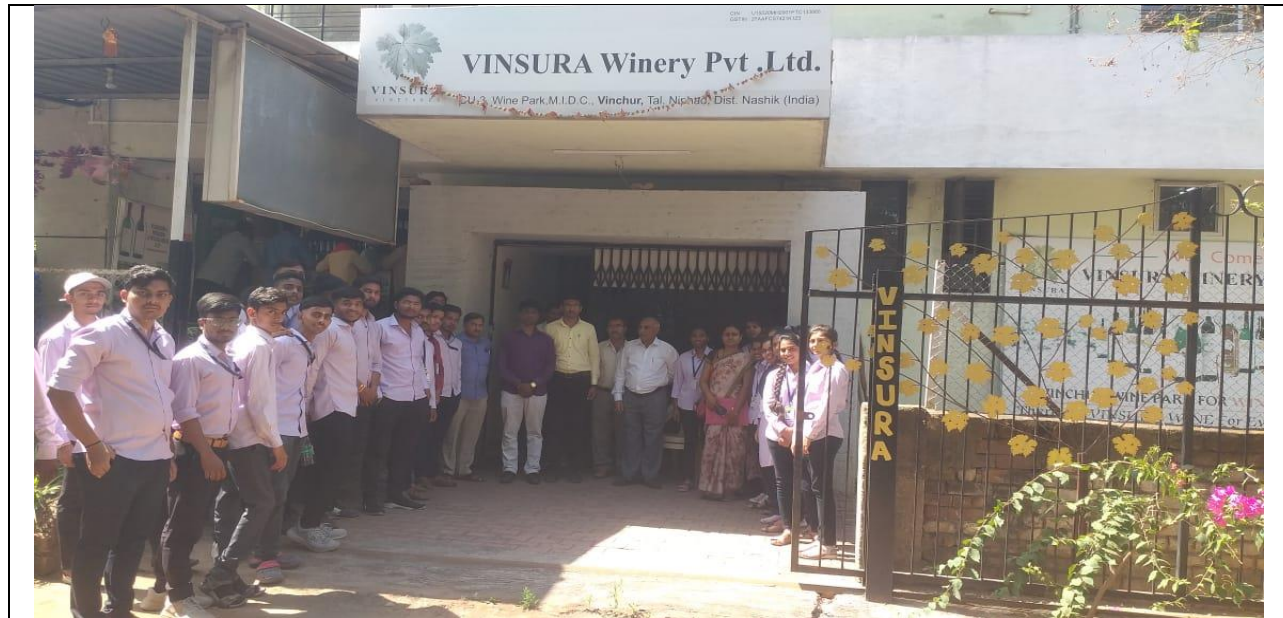
Vinsura Winery Pvt. Ltd. Vinchur, Nashik