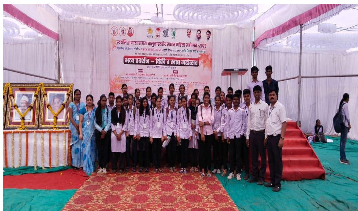
Visit to Swayamsiddha Yatra 10/12/2022