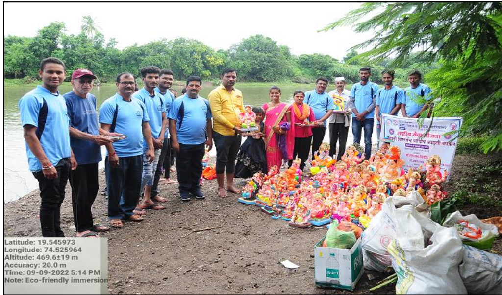
Idols and Holy waste collection from devotees