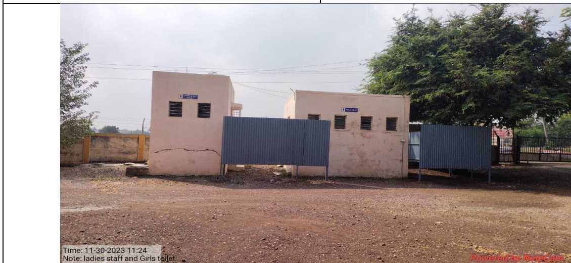
Ladies staff and girls Toilets